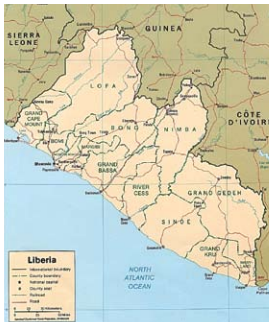
Map of Liberia

Matters came to a head when Taylor – under international pressure to quit, and with Monrovia surrounded by rebels