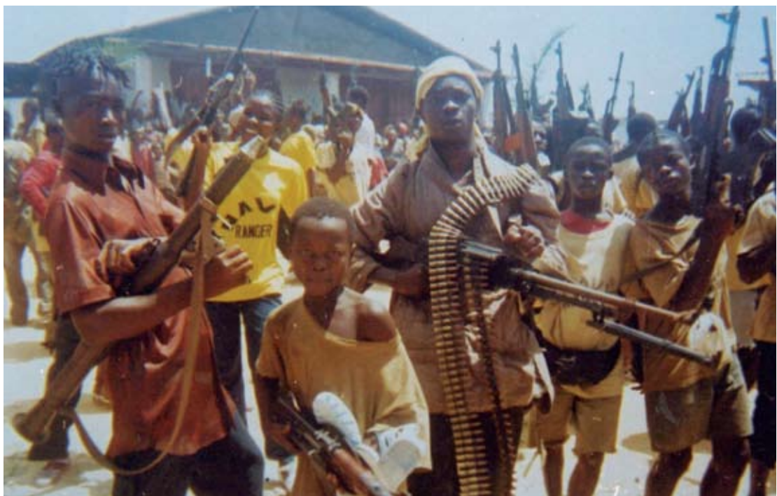
Navy rangers – pro-government militia funded by timber revenues, 2003

In support, the GOL has requested foreign governments to hold their domestic companies that benefited from Liberia's wars, accountable if they perpetrated or contributed to crimes committed during the civil conflict. 12