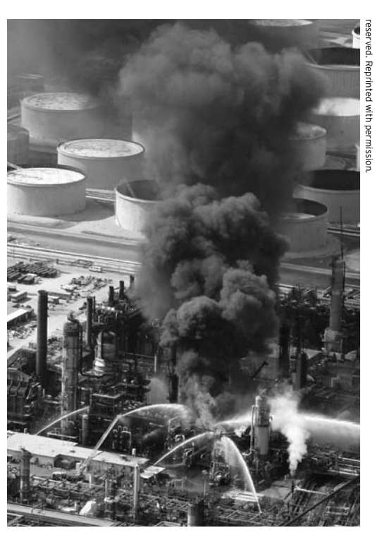
Fire burning at the Chevron refinery in Pascagoula, Mississippi.

We have not given up. But we need the support of those outside of our community to add to our numbers, our resources, and to help shine a bright spotlight on the crimes being committed here every day.