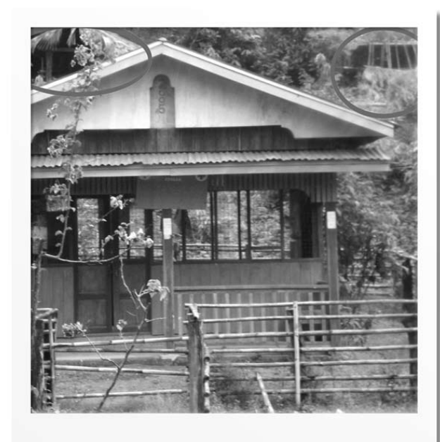
Police huts built with forced labor behind Chevron/Total Health Clinic in Zinba Village.

The project is linked to serious human rights abuses that have been the focus of landmark lawsuits in U.S. and European courts against Unocal (Chevron) and Total. These cases led to precedent-setting, out-of-court settlements benefitting local victims of abuse in 2005.