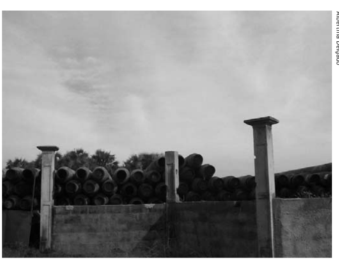
Used drilling pipes dumped near the sea.

Fishermen state that the real pollution crisis began in 2000-2002, impacting the local fishing industry and communities. No real catch are found any longer between the shores and the oil platforms, which now populate the sea. Since 2001, fishing is no longer the main activity of local communities, resulting from the constant oil spills and restrictions from both the government and Chevron stipulating that local fishermen are not permitted to fish beyond the platforms as they represent military threats. 189 These measures are linked to political and military instability. Many of the worst human rights violations in the country are committed—on an ongoing basis—in Cabinda. Fishermen complain that they must go north, close to the Congo-Brazzaville border, to fish. It is not only the constant oil spills that have affected fishing and the environment, but all related drilling operations. For some time now, Chevron has promised funding to restore the damaged ecosystem. 190 Thus far, nothing has materialized and the situation is deteriorating. It is not only the spills that affect the marine environment, but also the noise caused by oil exploration activities and the movement of boats.