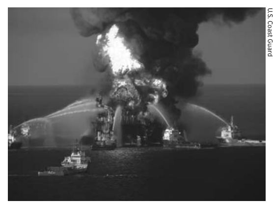
On April 20, 2010, BP/Transocean's Deepwater Horizon drill rig exploded in the U.S. Gulf Coast.

about meaningful changes in government policy. The most meaningful change that can and should be implemented today is a moratorium on offshore drilling.