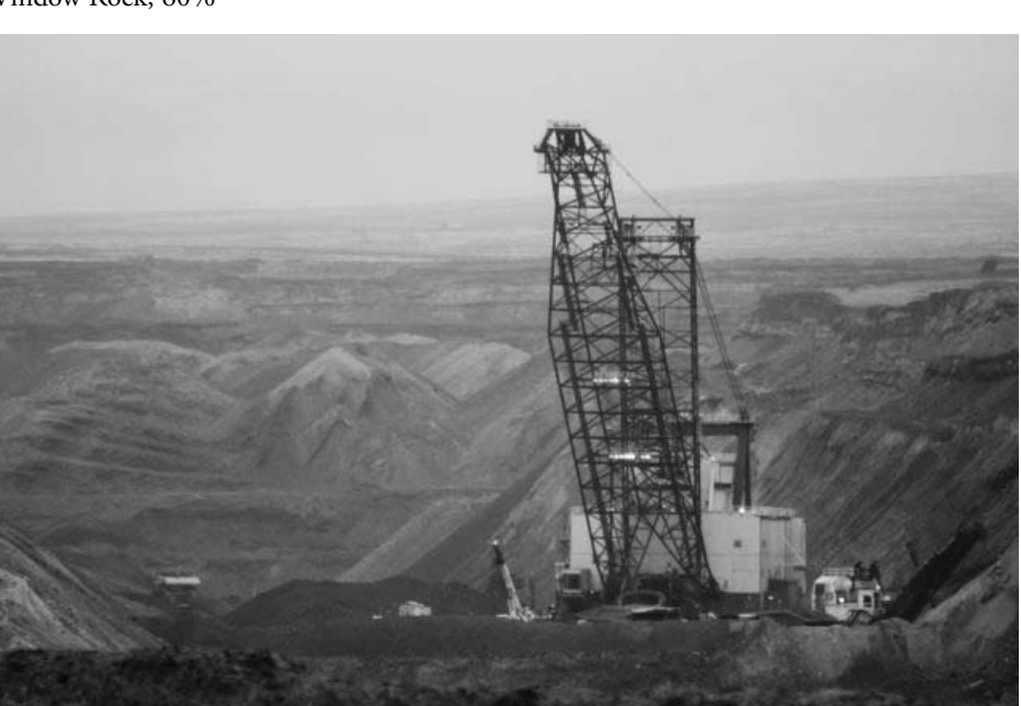
Chevron had plans to open its new coal mine in Powder River Basin, home to Arch Coal's Black Thunder Coal Mine, the largest producing mine in the U.S.

We strongly support Chevron's decision to turn away from coal and coal-to-liquids. We will continue to watch to ensure it fulfills this pledge and to ensure that any company that steps in to take its place will face the same pressure to withdraw.