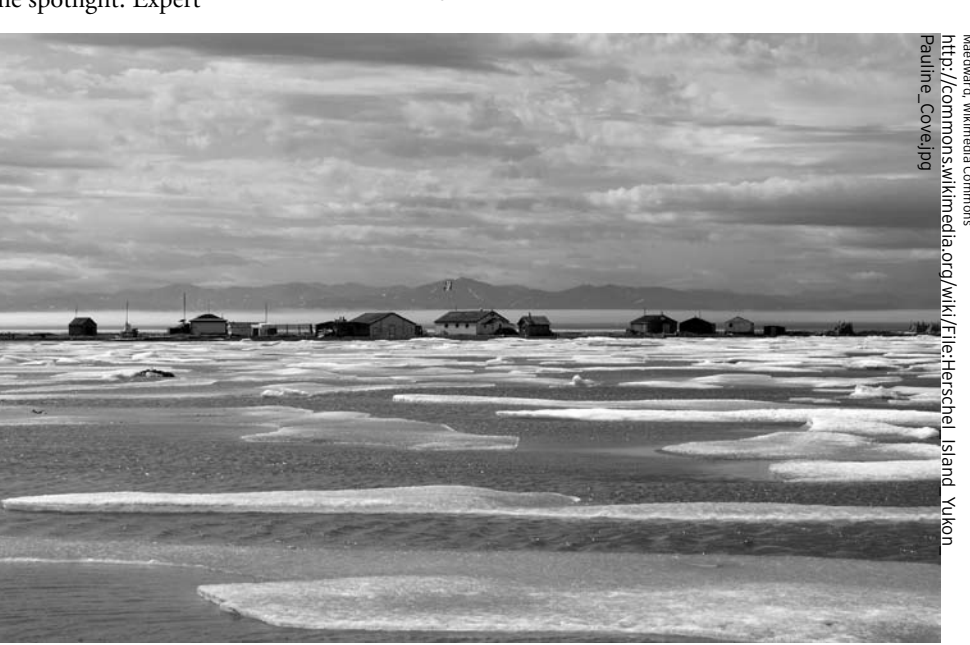
The historic buildings at Pauline Cove, Herschel Island, Yukon.

In light of the serious risks posed by offshore drilling and the urgent need to address the climate crisis by leaving fossil fuels in the ground, the Council of Canadians campaigns against offshore drilling in the Beaufort Sea.