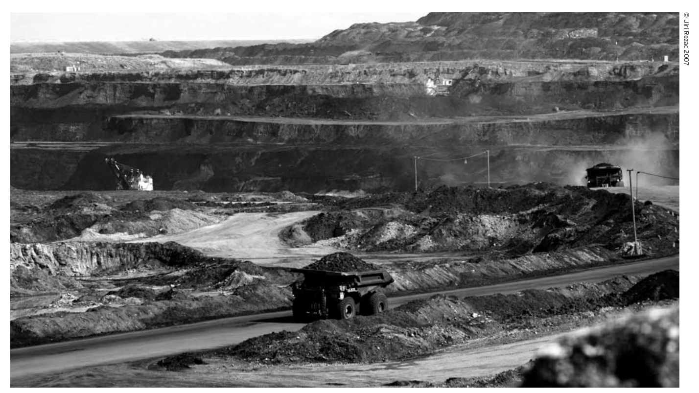
Muskeg River Mine, part of the Athabasca Oil Sands Project.

behaving the last 40 years, there will be no turnback because it will be the total destruction of the land."272