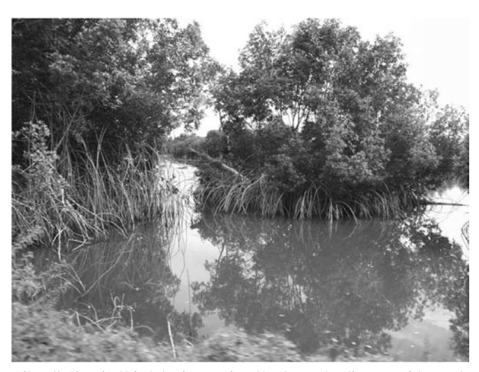
Oil pollution in this lake is causing the trees to die, as evidenced by the barren roots.

What the company has invested in corporate responsibility is far, far from being proportional to the huge profits it reaps. For many years, Chevron's oil operations have caused serious damage to the environment, yet the company has gotten off with complete impunity. The government has been complicit in letting Chevron off the hook, but they know about all about the spills in Cabinda.