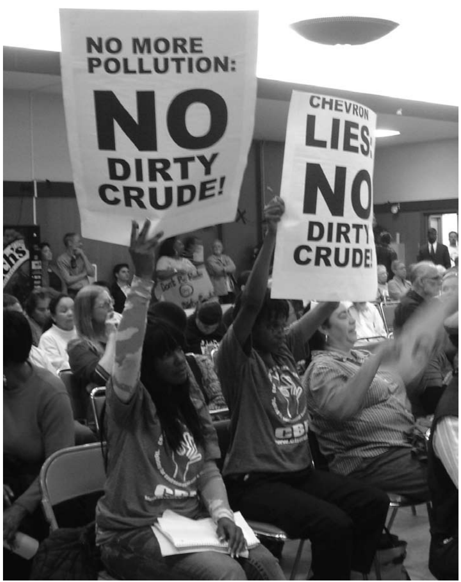
Richmond students support clean air, not pollution.

By February 2010, Chevron, CBE and environmental justice groups had not reached a settlement in negotiations. At