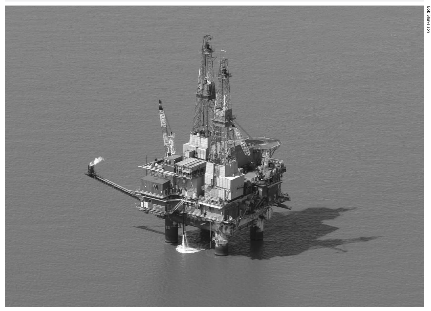
Chevron enjoys a unique subsidy in Alaska's Cook Inlet: It's the only waterbody in the nation where industry can dump billions of gallons of toxic drilling and production wastes into rich coastal fisheries each year.

Bob Shavelson and Tom Evans, Cook Inletkeeper