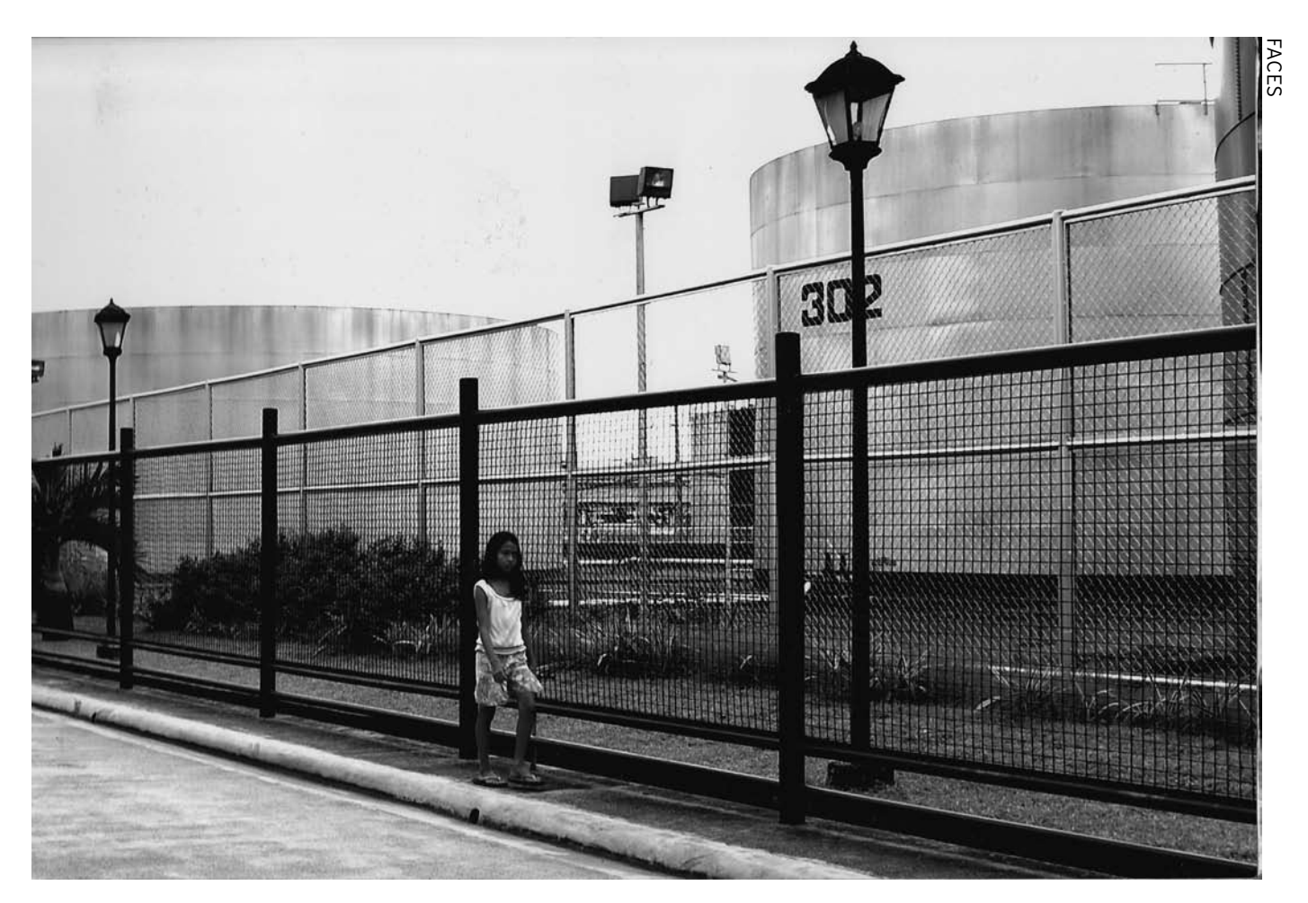
Chevron and its partners built this "linear park," with walkways and basketball courts surrounding its oil depot. Residents, like this young girl, pass through the depot daily.

AESJ, with a growing network of residents and allies, are rallying hundreds of supporters behind a "Three R's campaign"— with the goal of achieving Relocation, Remediation and Revitalization. In place of the depot, they want to see environmentally sound redevelopment that benefits residents, with health centers, schools, livelihood jobs and affordable housing. Groups press for a speedy, but responsible closure of the depot, and not to create "another Pandacan" that endangers other communities.