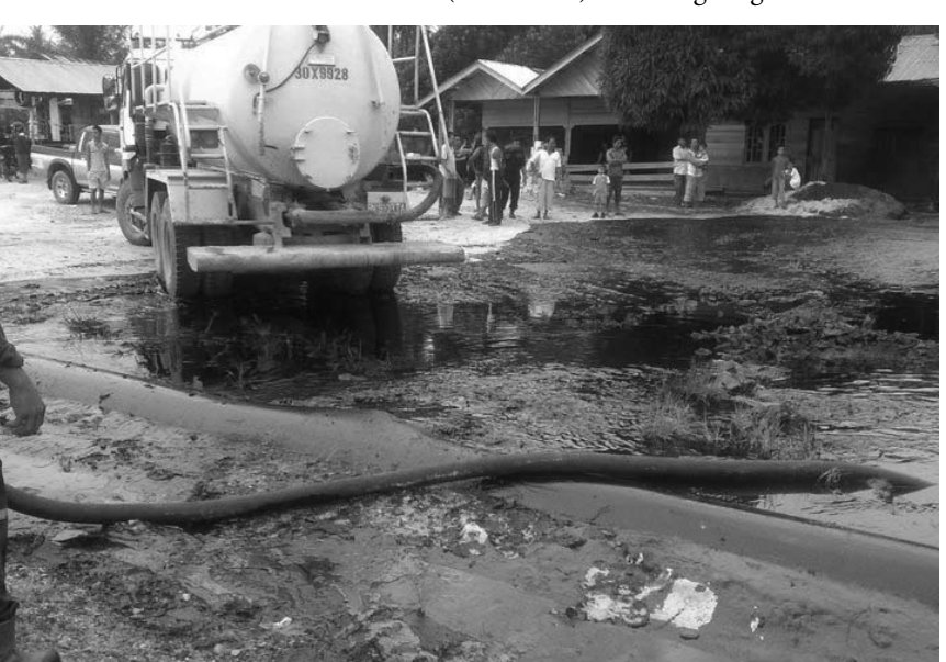
Spilled oil resulting from the 2010 pipeline explosion in Manggala Jonson Village.

Currently, the state-owned Executive Agency for Upstream Oil and Gas (BPMIGAS) is investigating the land con-