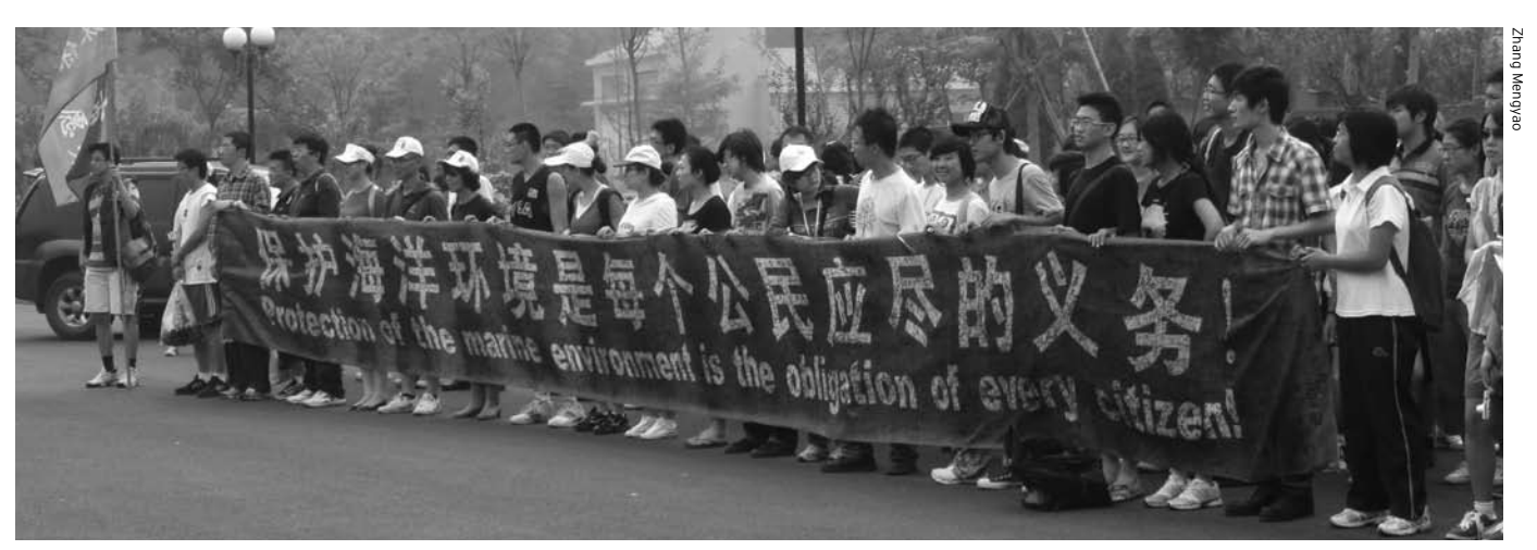
Chinese citizens rally to advocate marine environmental protection.

In North China, the Bohai Sea is another territory where Chevron has a heavy marine footprint. In Bohai Bay, Chevron has a 16.2% interest in the Bozhong 25-1 oilfield and 24.5% in the QHD 32-6 oilfield.301 The prospect for more oil in the