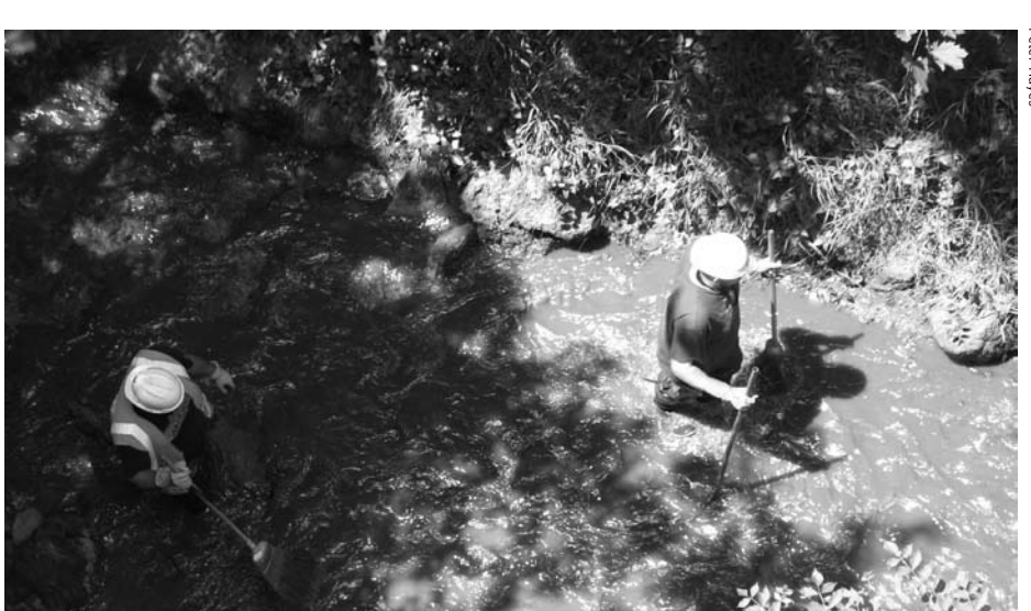
Following the June 2010 spill of a Chevron pipeline, crews "cleaned" Red Butte Creek with brooms and an inefficient water jet that simply sprayed cold stream water onto rocks that were coated with dried crude oil. Local resident Peter Hayes watched these crews flip many of the oil-soaked rocks over, effectively hiding the crude coating under water.

Chevron's inadequate response to the threats posed by its refining and pipeline transport operations in Utah leaves the local community at continued risk of exposure to harmful toxins.