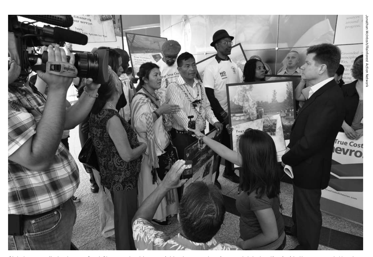
Global community leaders confront Chevron about human rights abuses and environmental destruction inside the company's Houston office the day before the corporation's 2010 annual shareholder meeting.