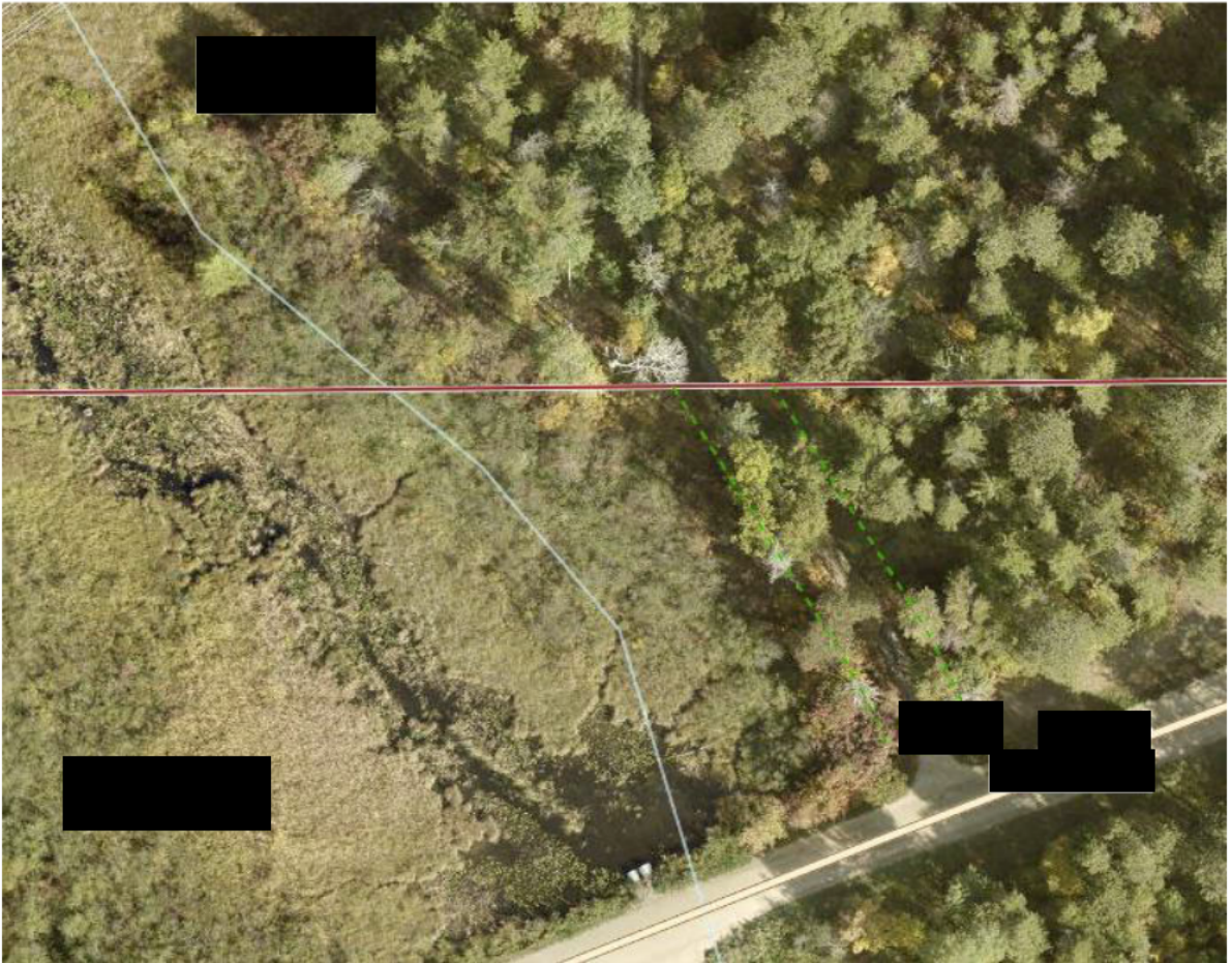
Figure 2: Image of the driveway to the Property from the Hubbard County GIS system

and the structures on the Property to [REDACTED]. This portion is bounded by the green dotted lines in the image below (Fig. 2).