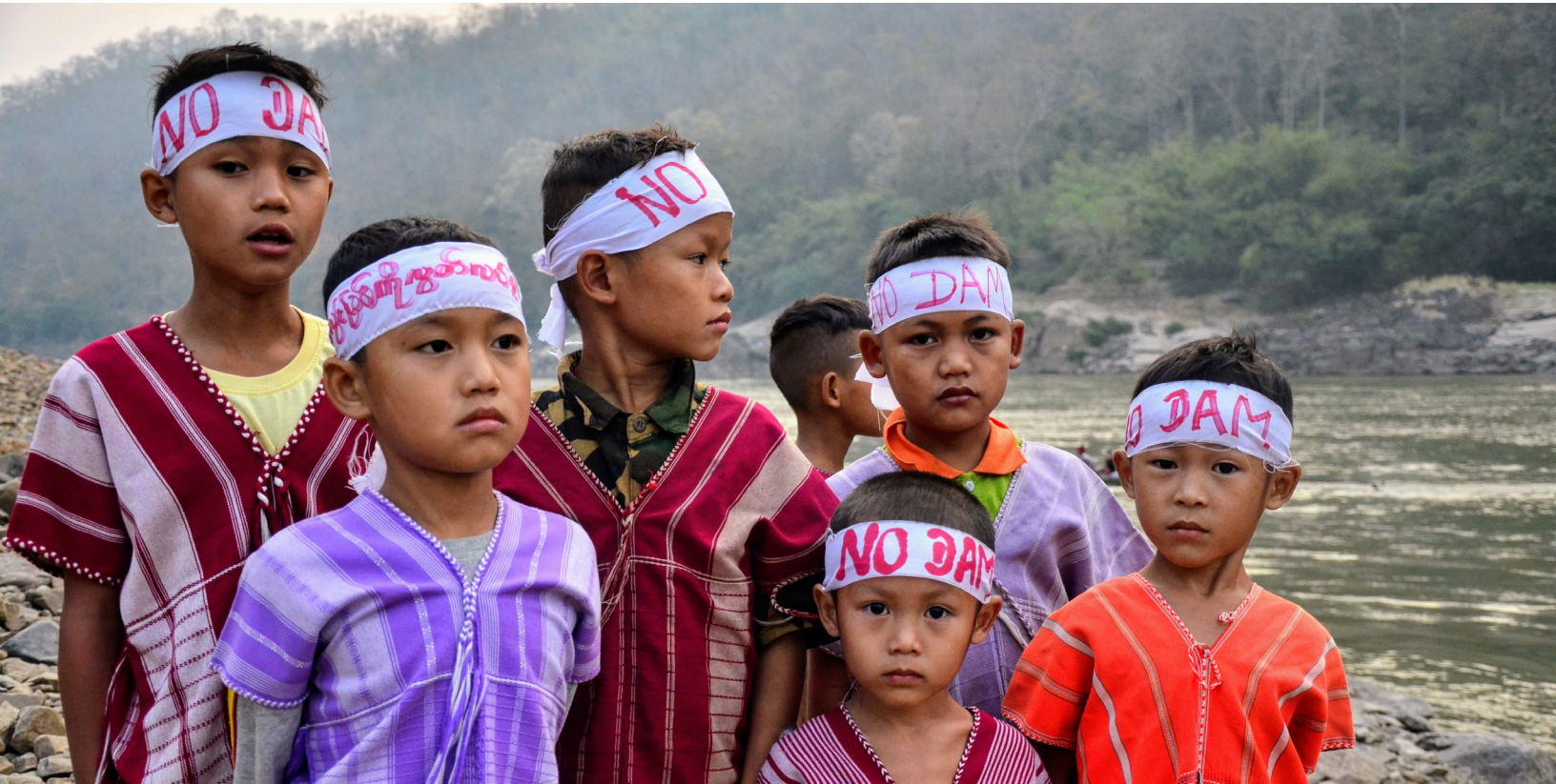
Young advocates for the Salween communities participate in a celebration on International Day of Action for Rivers, March 14, 2018.

This brief presents key information on the Hatgyi dam, a Thai-financed and developed hydropower dam in Myanmar, including environmental and social impacts, and advocacy conducted by EarthRights International, Foundation for Environment and Natural Resources, Salween Peoples Network, and Salween Watch Coalition. This brief reflects issues submitted to the United Nations Working Group on Business and Human Rights during their official visit to Thailand in early 2018.