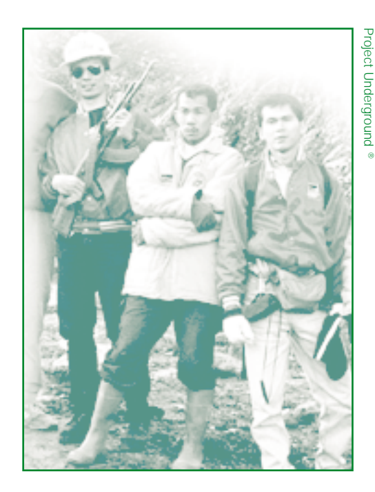
Freeport McMoRan in Indonesia.

Freeport is not required to disclose whether it has a formal security arrangement with the Indonesian military. Documents leaked by company insiders, however, show Freeport expenditures of nearly $10 million for military and police headquarters, recreational facilities, guard posts, barracks, parade grounds, and ammunition storage facilities. Knowledgeable observers state that this is just the tip of the iceberg. In response, company officials claim that Freeport's contract requires the provision of logistical support to the Indonesian military and police, an assertion that a careful reading of the contract belies.