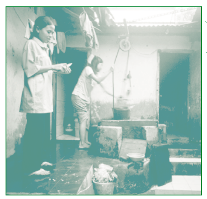
Workers for NIKE subcontractor in Indonesia

Restrictions on organizing are not the only labor rights violations that workers at Nike factories face. Unless properly managed, the processes involved in sport shoe production can pose very serious risks to workers' health and safety. Potential problems include exposure to dangerous chem-