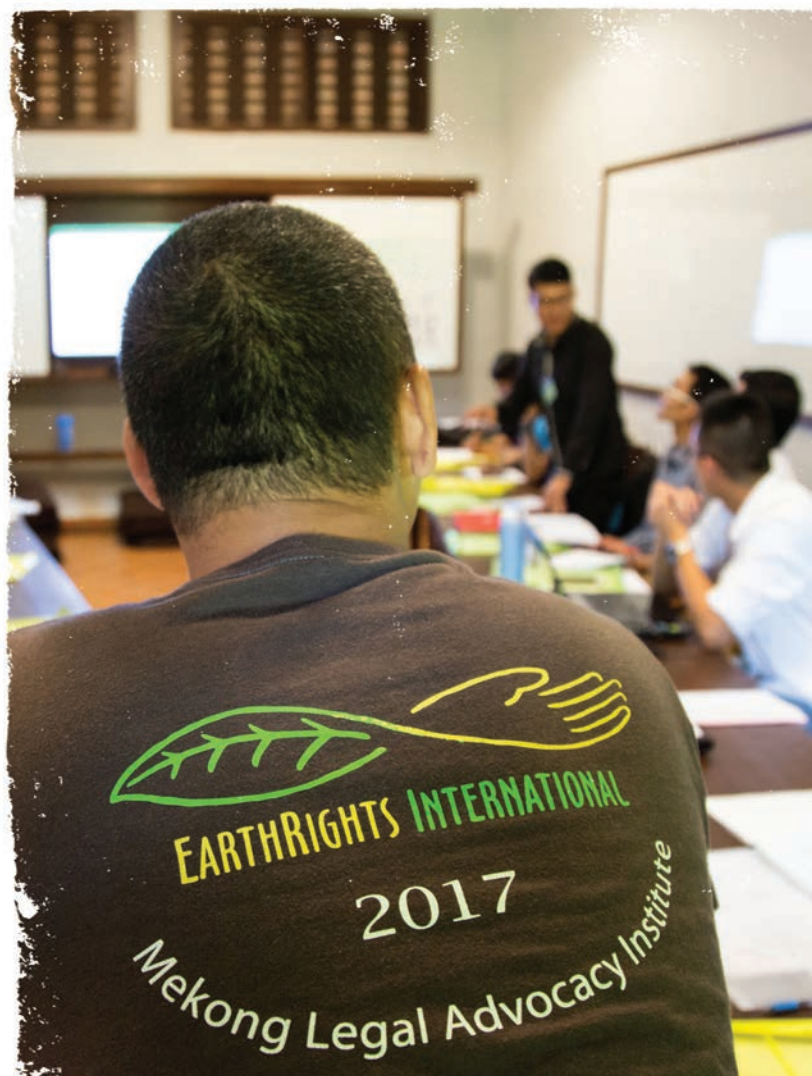
Participants at the Mekong Legal Advocacy Institute at the Mitharsuu Center for Leadership and Justice.

The global protection strategy contains concrete actions that will help reduce the number and severity of attacks against earth rights defenders. The strategy includes actions to fight projects that extract and exploit, fight corruption, challenge donor policies that harm defenders, strengthen the skills of and resources available to earth rights defenders, and includes options for use of the legal system. It is our hope that by outlining our vision and strategy that civil society – including both national and international NGOs – can act in a coordinated and strategic way, and with our collective efforts scaled up, to be more effective in working to reduce threats and attacks against earth rights defenders. We also hope that the strategy acts as a guide for funders, and a resource for communities, governments, international