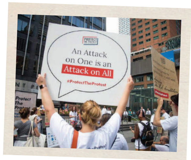
At the launch of the Protect the Protest task force, activists and advocacy groups threatened by SLAPPs (Strategic Lawsuits Against Public Participation).

The global human rights regime can both help keep defenders safe by drawing international attention to their specific situations and, more importantly, by drawing attention to some of the structural issues that cause threats to defenders. Internationally, this includes use of the Universal Periodic Review process and the special procedures of the Human Rights Council, such the Special Rapporteur on the situation of human rights defenders or Special Rapporteur on the rights of indigenous peoples both who are able to act on individual cases and intervene directly with governments. The Universal Periodic Review process could also be used to highlight the ways that a government is undermining the ability of earth