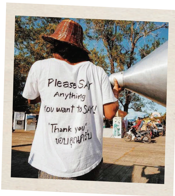
A defender in Dawei, Myanmar.

The ATS has been an important tool allowing victims and survivors of some of the most horrific abuses – including torture, crimes against humanity, and genocide – to sue those responsible in the U.S. and to obtain justice. 103 While early human rights ATS cases were primarily filed against individuals, beginning in the 1990s, a number of cases were filed against multinational corporations for their complicity in human rights abuses. In 1996, ERI filed Doe v.