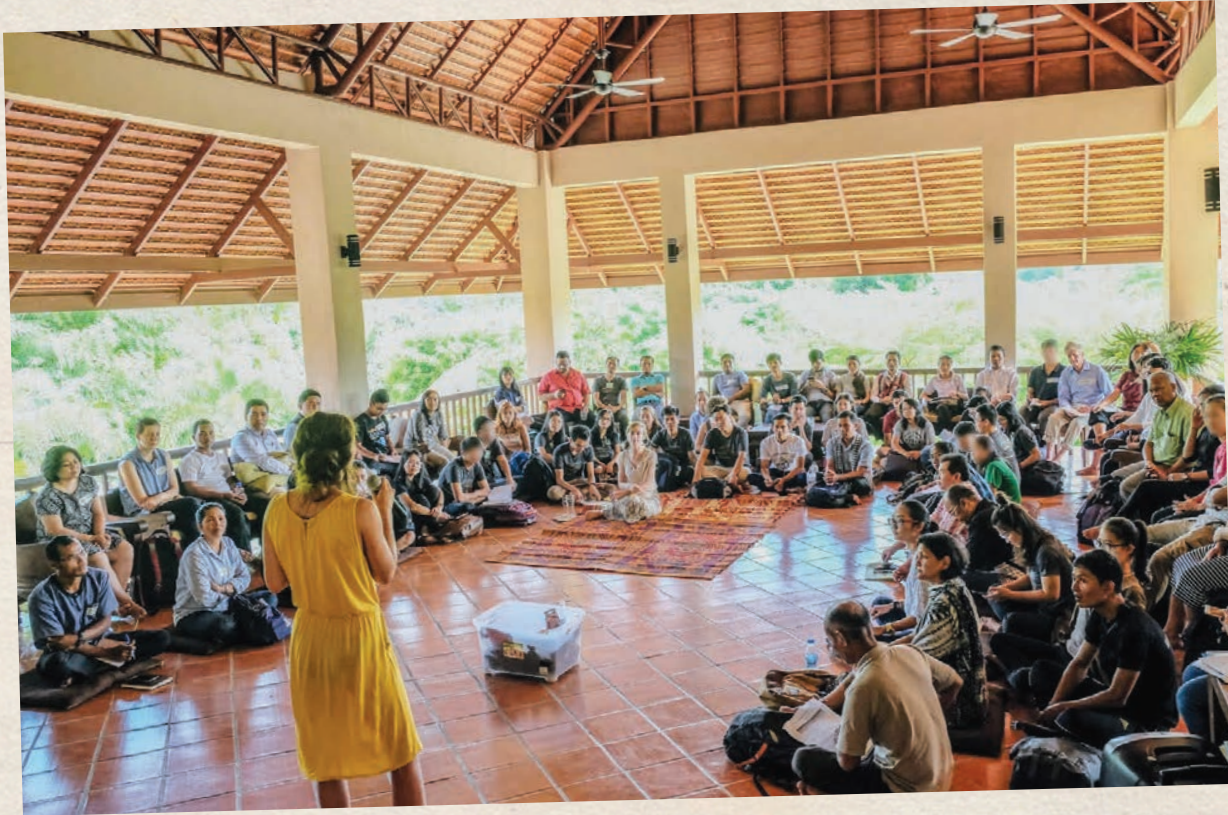
Earth Rights Defenders at the Forest Defenders Workshops at the Mitharsuu Center for Leadership and Justice.

At a regional level, the IACHR, for example, has powers to investigate the situation of individuals whose human rights are at risk and make recommendations to the responsible government accordingly. The IACHR is also able to request urgent measures or order precautionary measures to prevent and protect against potential serious and irreparable harm to persons or groups of persons who are in imminent peril. 86 In Asia, civil society is working to improve the effectiveness of regional human rights institutions, primarily the ASEAN Intergovernmental Commission on Human Rights, which has a potentially useful role to play here.