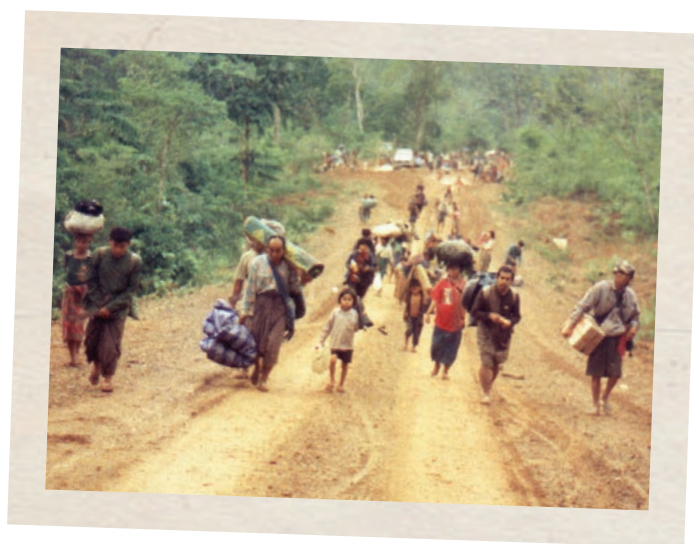
Villagers fleeing Burmese military violence in the Yadana pipeline in 1995.

This strategy provides a partial roadmap to potential solutions, and a world in which earth rights defenders can peacefully speak out in defense of their rights and homelands without fearing retribution. The 20th anniversary of the UN Declaration on Human Rights Defenders also presents the global community with an opportunity to celebrate the importance and legitimacy of all human rights defenders, and their rights to peacefully protest all exploitation and abuse, including the exploitation and abuse of this finite planet on which we all depend.