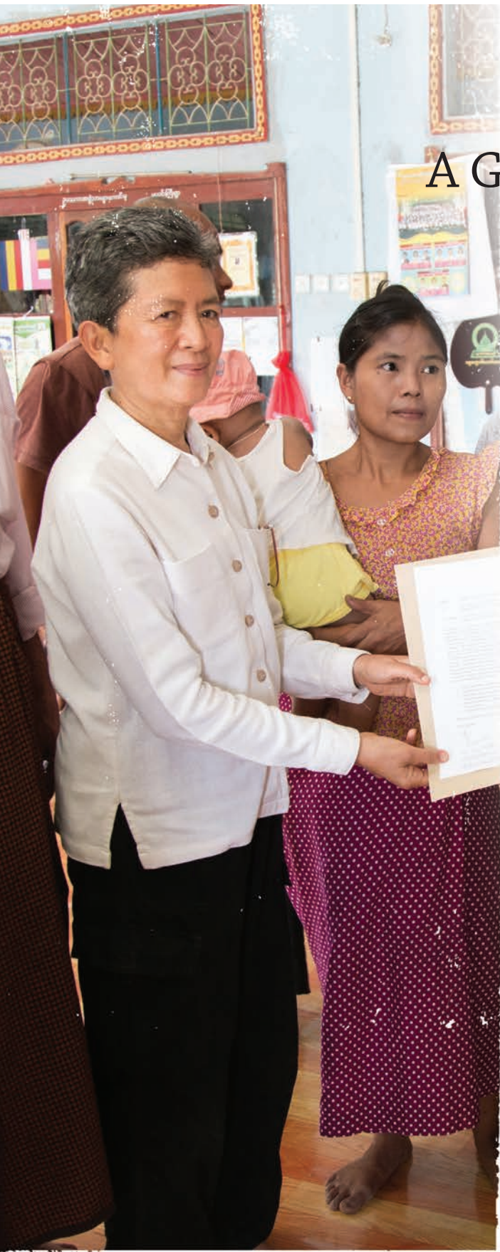
Tuenjai Deetes, from the Thai National Human Rights Committee visits the Dawei Special Economic Zone in Myanmar.