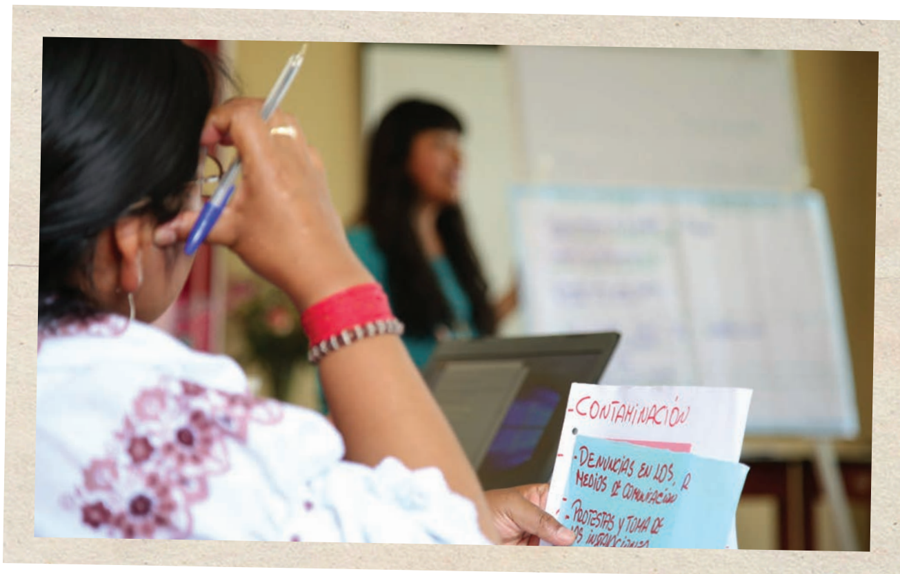
A participant in the ERI's annual Latin American Indigenous Legal Seminar.

and the environment, they do not sufficiently address rights-related risks or provide protection to human rights defenders. 48 For example, the Sustainability Framework of the International Finance Corporation (IFC) – which is the largest of the IFIs focused exclusively on the private sector (including the mining, oil, and gas sectors) in developing countries, and a member of the World Bank Group – does not mention the need to ensure protection of human rights defenders.