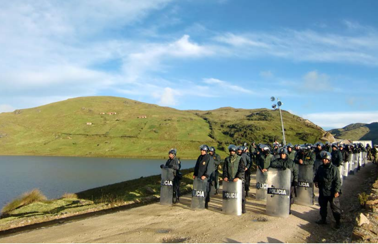
Police forces using the government-issued uniform and gear, block the entrance to the Yanacocha mine.

law enforcement. However, the analysis reveals that the difference of treatment that the regulation of the extraordinary police service and the subscription to these agreements are not justified. Consequently, it does not meet the requirements of proportionality in the strict sense.