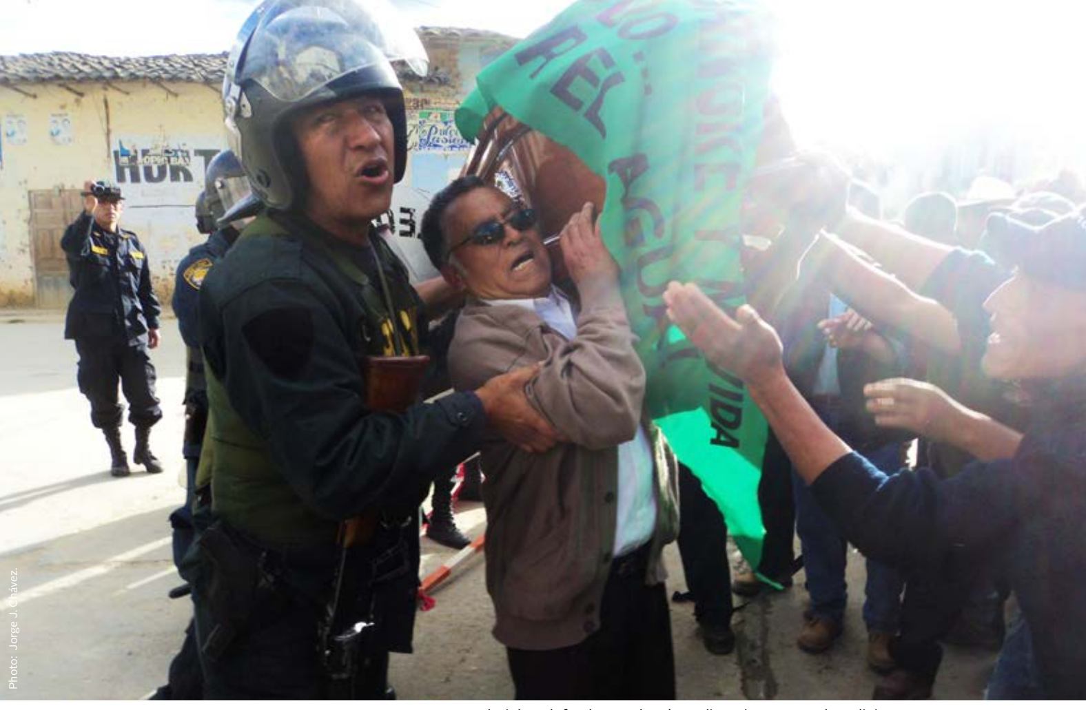
At an earth right's defender's wake, the police tries to stop the religious ceremony based on the State of Emergency declared by the Peruvian government.

The function of the PNP is obviously a public function. As such, it is permanent and on a full-time basis. One does not cease to be a public official at the end of the working day. The situation is even more sensitive when it comes to police officers since they exercise the monopoly of the legitimate use of state force.