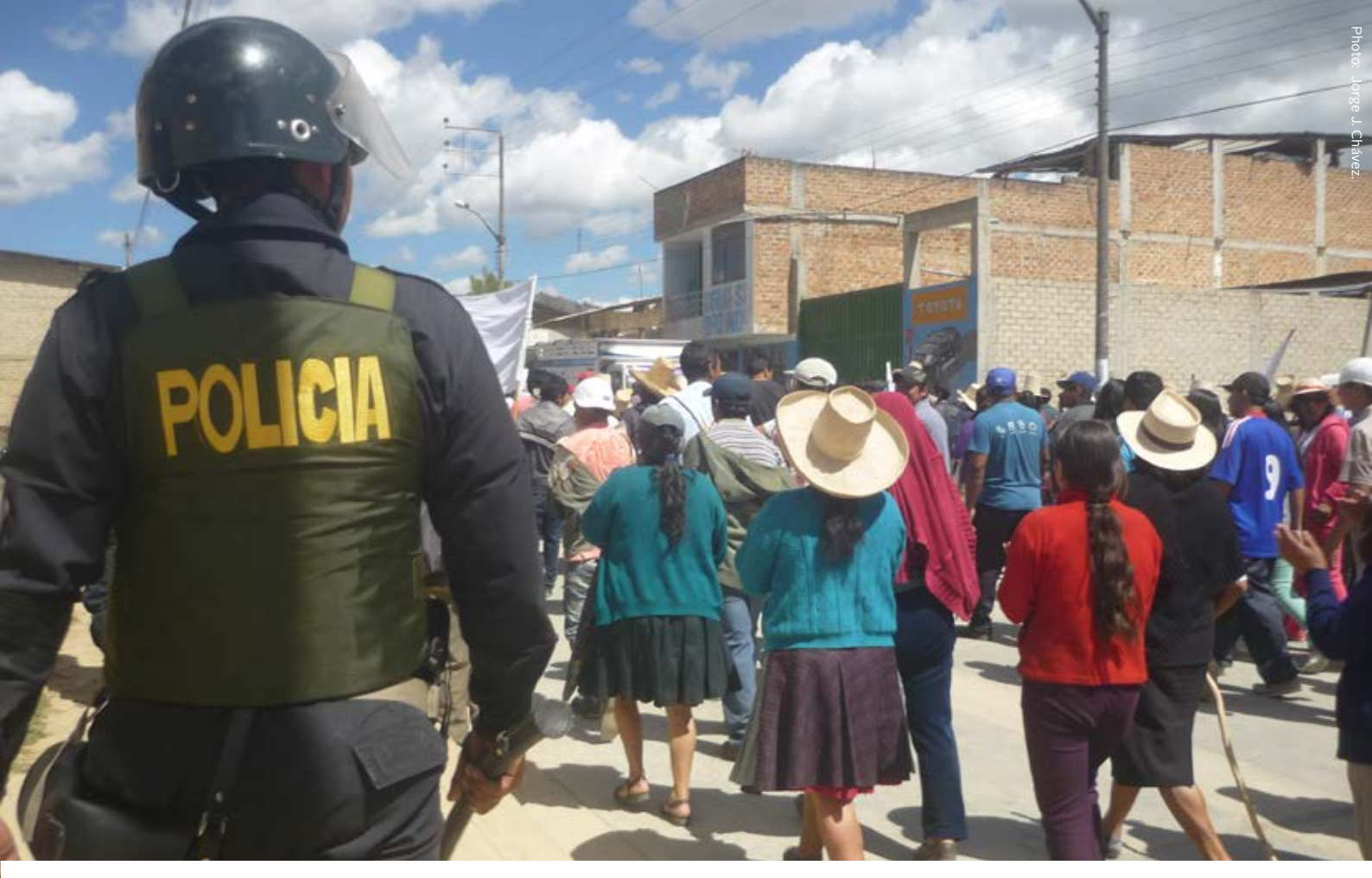
The fact that the police officers use their uniforms as is stated in the agreements violates the principle of legality, as this type of exhertion of a preventive force hasn't been regulated by the peruvian legal system.

protect the citizens. For instance, in 2017 there were 673 inhabitants10 per police officer, while in 2016, there were 755 inhabitants per police officer.