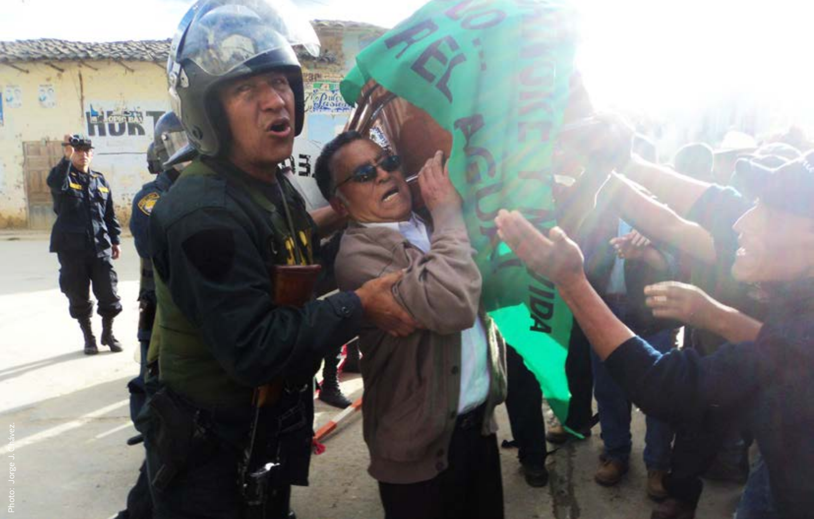
At an earth rights defender's wake, the police tries to stop the religious ceremony based on the State of Emergency declared by the Peruvian government.

The function of the PNP is obviously a public function. As such, it is permanent and on a full-time basis. One does not cease to be a public official at the end of the working day. The situation is even more sensitive when it comes to police officers since they exercise the monopoly of the legitimate use of state force.