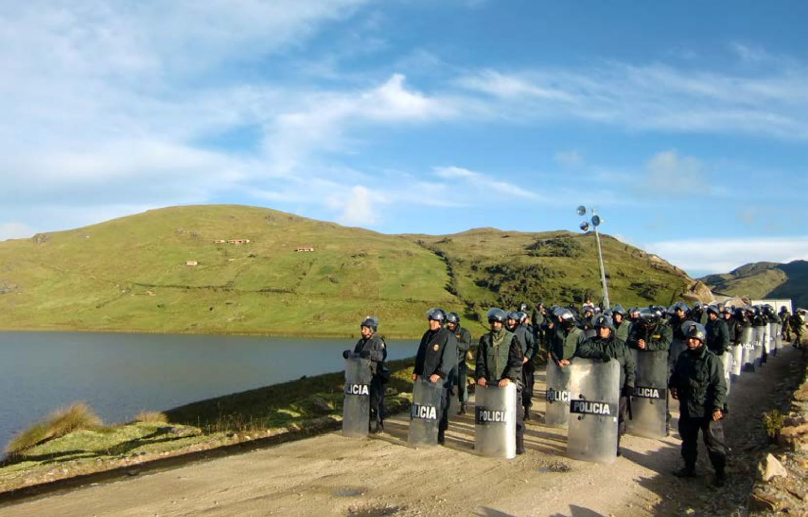
Police forces using the government-issued uniform and gear, block the entrance to the Yanacocha mine.

law enforcement. However, the analysis reveals that the difference of treatment that the regulation of the extraordinary police service and the subscription to these agreements are not justified. Consequently, it does not meet the requirements of proportionality in the strict sense.