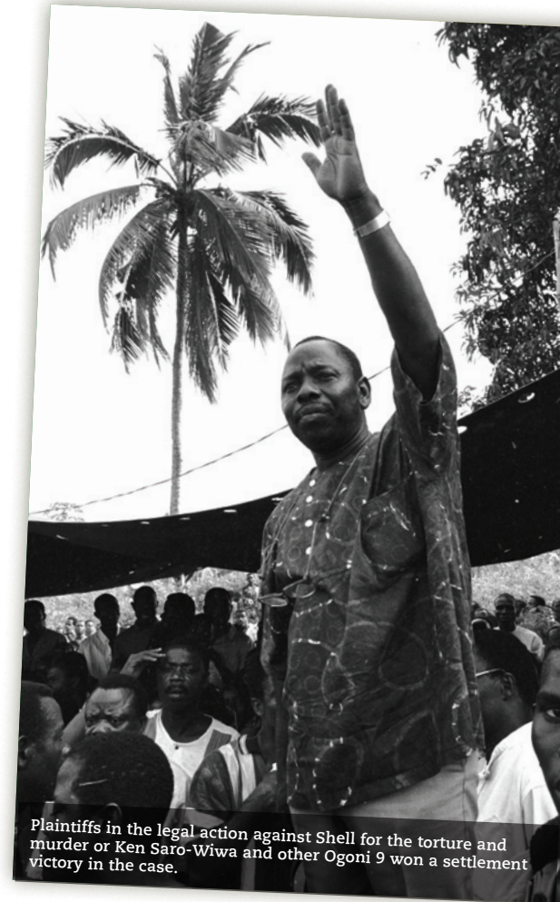
Plaintiffs in the legal action against Shell for the torture and murder of Ken Saro-Wiwa and other Ogoni 9 won a settlement victory in the case.

On the cover: A fisherman checking his traps on the Mun River.