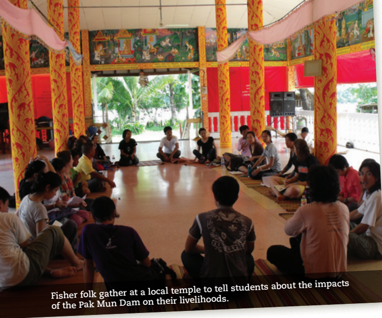
Fisher folk gather at a local temple to tell students about the impacts of the Pak Mun Dam on their livelihoods.

WITH ERI SUPPORT, EARTHRIGHTS SCHOOL ALUMNI PUT THEIR NEWLY ACQUIRED ADVOCACY SKILLS INTO ACTION in numerous local and cross-border joint activities, contributing to the ASEAN Peoples Forum in Bangkok and Cha Em, Thailand, the World Bank Conference in Vietnam, Indigenous Rights training in Australia, and the NGO Forum on the Asian Development Bank in Cambodia, as well as participating in the Mekong Ecology and Energy Network and the Save the Mekong campaign.