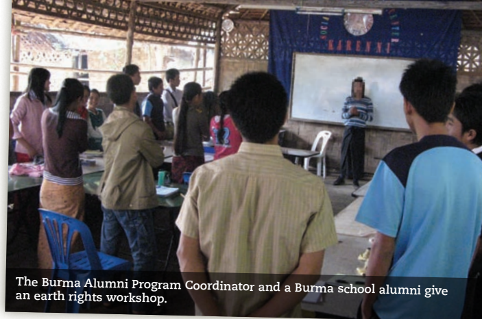
The Burma Alumni Program Coordinator and a Burma school alumni give an earth rights workshop.

THE PUBLICATION, FROM GRASSROOTS TO GLOBAL: VOICES FROM BURMA ON EARTH RIGHTS ABUSES , collected the human rights and environmental reports of the ERSB students, prepared as part of their fieldwork research. This publication raised the courageous voices of the people in rural areas