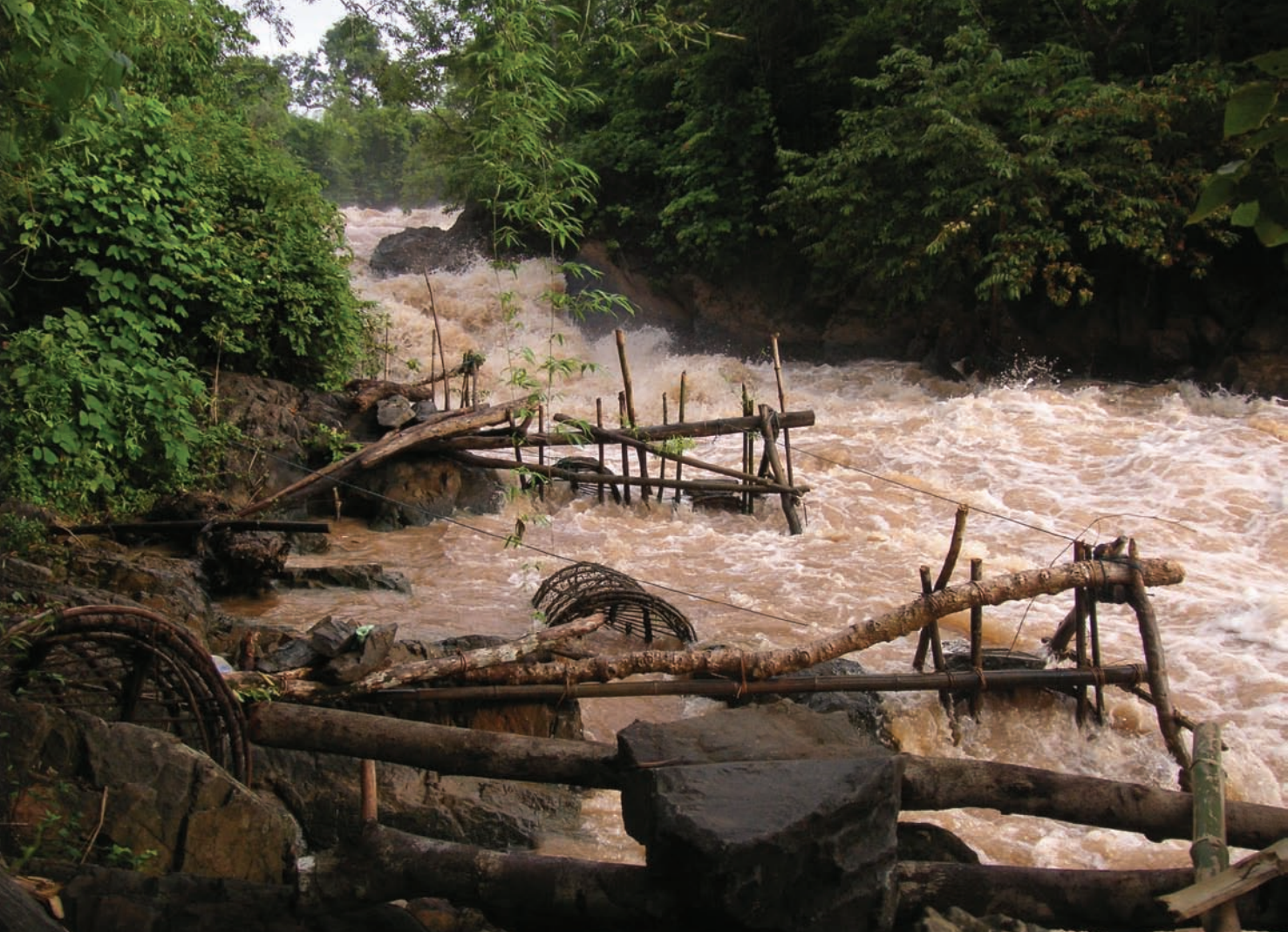
Site of the proposed Don Sahong Dam, which would block vital fish migration channels and threaten the food security of millions.